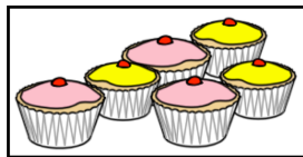
Box of 6 cupcakes